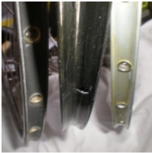
Photo 1: From left, Mavic GP4, Ritchey WCS Apex, Mavic Reflex tubular rim bed profiles.

As promised, here's the procedure for gluing a 'cross tubular tire so it won't come off. Though it can still ruin your day, the downside of rolling a tubular in 'cross is generally not as big as in a criterium or on a winding mountain descent.